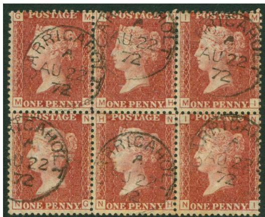
27 SG 43 1d rose-red plate 151. Very fine used block of 6 cancelled with Carrigaholt CDS's, Aug 22 nd 1872. £180