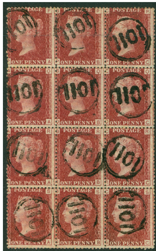
26 SG 43 1d rose-red plate 147. Very fine used block of 12 with telegraphic '1101' cancels. £375