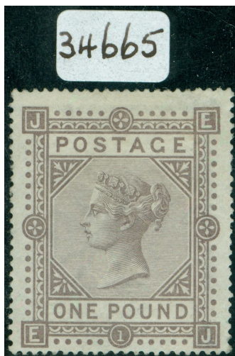
SG 129 £1 brown-lilac, watermark Maltese cross. Very lightly mounted mint, good colour & well centred for this issue. An exceptional example CAT £75,000. David Brandon cert. £45,000