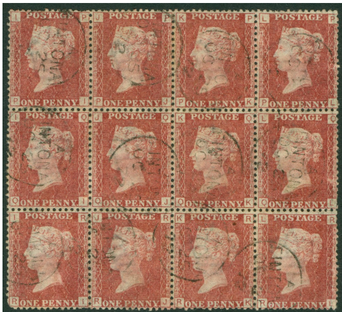
25 SG 43 1d rose-red plate 123. Very fine used CDS block of 12. £375