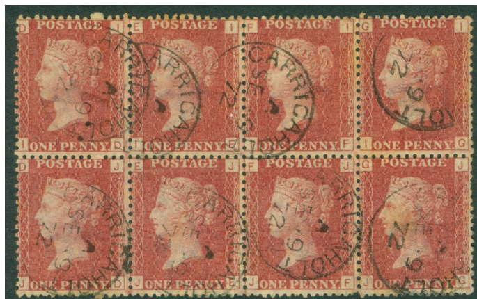
28 SG 43 1d rose-red plate 158. Very fine used block of 8 cancelled with Carrigaholt CDS's, Sept 9 th 1872. £275