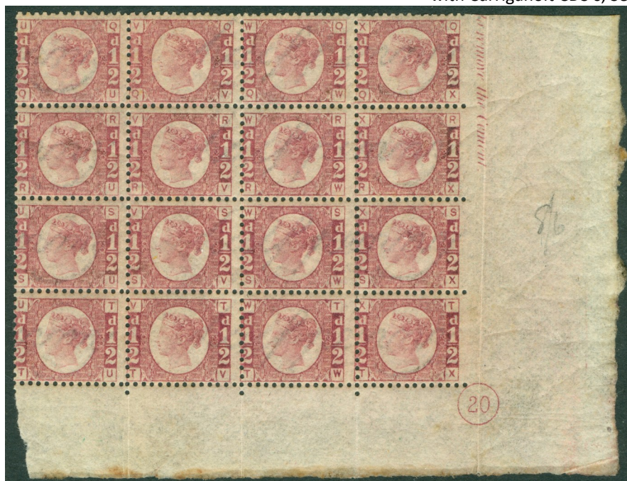
29 SG 48 1/2d rose-red plate 20. Unmounted mint corner control marginal block of 16 CAT £5600. £1750